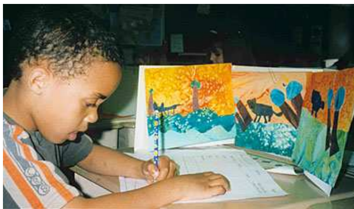
A boy uses his original art to support story writing.

Image-Making Within the Writing Process, developed in 1990, begins with students creating their own portfolios of hand-painted textured papers. Students discover stories hidden within these abstract images that they have created and then write collage stories using their papers as raw materials. Picturing Writing: Fostering Literacy Through Art, developed in 1996, teaches key literary elements through simple art processes and the use of quality literature. Although both processes are easily integrated into the curriculum, the Picturing Writing process provides a simpler, more foundational art and writing experience: Using crayon-resist art techniques, students create representational images thematically linked to content that they are studying, such as weather or biomes. Students create their pictures before they write. Both instructional models are carried out within an artists/writers workshop framework.